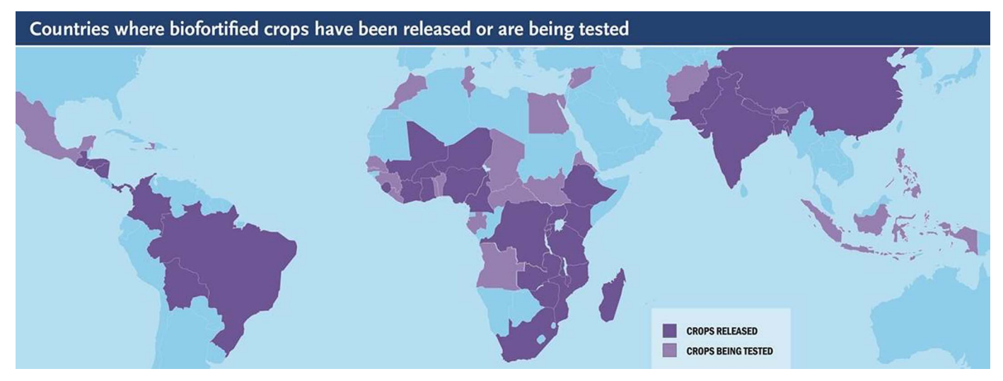
Fig. 2. Biofortified crop map (Jan 2017).

micronutrient content for release and/or dissemination as "fast track" varieties, while varieties with target micronutrient content are still under development, and 2) deploying multi-location Regional Trials across a wide range of countries and sites to accelerate release processes by increasing available performance data of elite breeding materials. Regional Trials also include already-released biofortified varieties and generate data on their regional performance, in order to take advantage of regional variety release systems such as under SADC (Southern African Development Community). Such regional agreements harmonize seed regulations of member countries and allow any variety that is tested, approved, and released in one member country to be released simultaneously in other member countries with similar agro-ecologies.